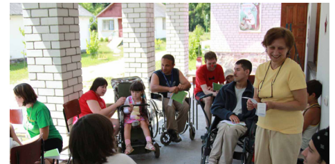
English lesson. SNM camp 2009

I thank my Creator for his mercies and grace, his miracles and healings, His support in times of trouble and His continuing presence. Most of all, I thank Him for entrusting me with such a wonderful and significant ministry: to serve children with disabilities and their families.