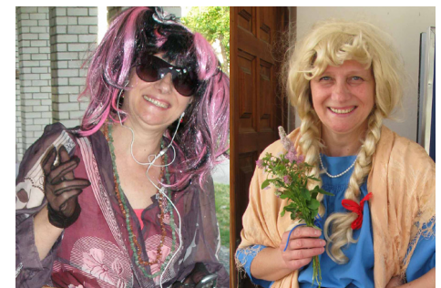
Ready for skits. Camps 2007/2009