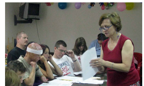
English lesson at MTU 2009